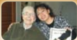
"She takes such good care of me, she's a sweetheart." - Real At Home Care Solutions Client & his Caregiver